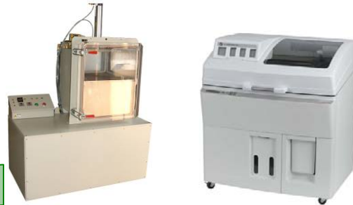
xlaFORM INFUSER ZCORP 3D PRINTER