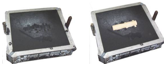
SAND MOLD & CORE SET